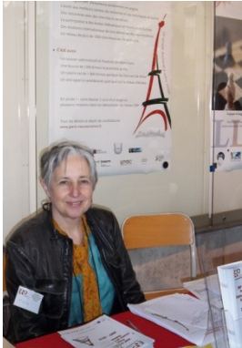
At the 11th Cognitive Science Forum