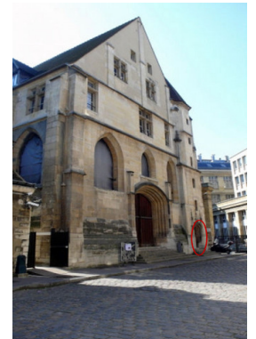
Le Réfectoire des Cordeliers