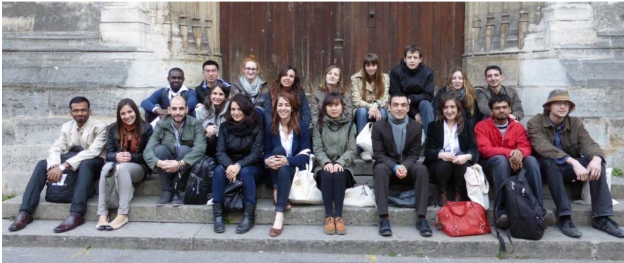
The twenty international candidates invited to take the auditions in Paris to enter the 2014 ENP Graduate Program, on the steps of the Réfectoire des Cordeliers.