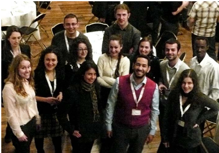
The candidates on Thursday's night dinner.

9 applicants were recruited, 5 accepted and entered the ENP Graduate Program.